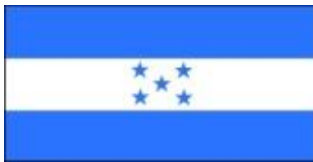
Honduras in Central America and Honduras Flag (classroomclipart.com)