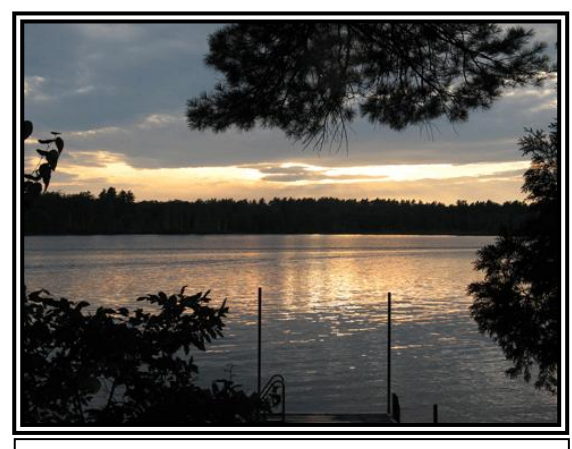
View of Maranacook Lake from Whispering Pines Camp

We are a warm, caring church that seeks a minister who is patient with our decision-making process, who will challenge us intellectually, who will share the life journey with us, preach to us rather than at us, lead us without directing us and who will help us grow spiritually. We want to grow as a congregation, both spiritually and in numbers. Come grow with us!