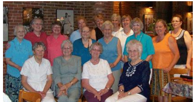
Women's Guild – Ladies Night