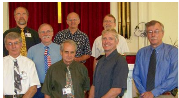
Father's Day Ties