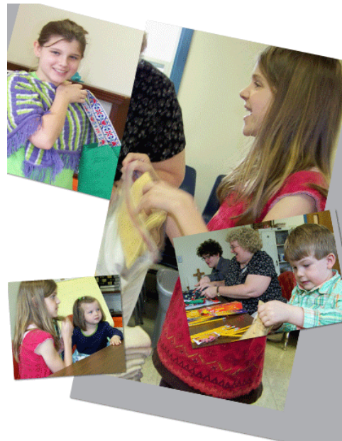
Packing CWS Kits