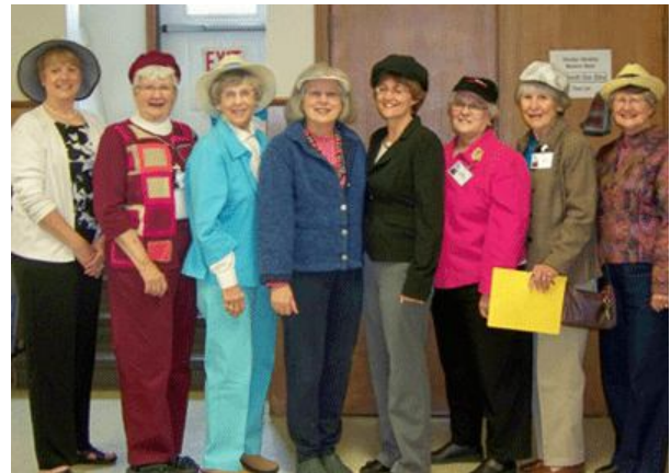
Mother's Day Hats